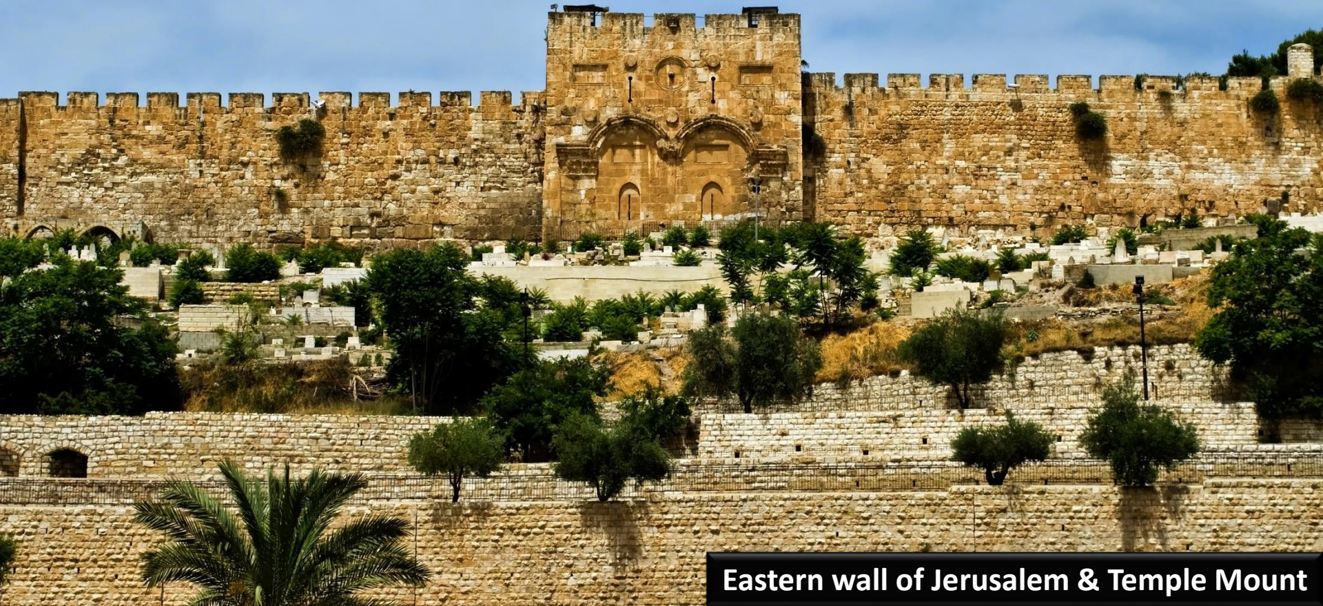
Eastern wall of Jerusalem & Temple Mount